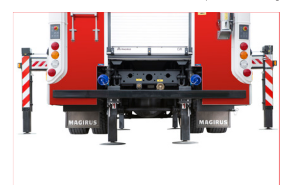
6-way jacking system