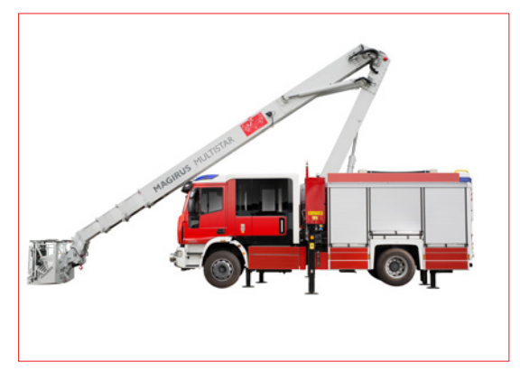
Telescopic boom with operating range from -12 m bis + 30.5 m

Illustrations may include additional options. We reserve the right to make technical changes or improvements at any time without prior notice. Errors and omissions excepted.