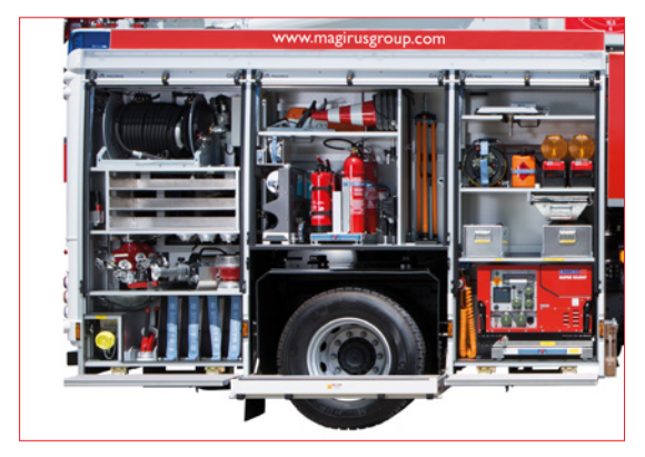
Equipment (exemplary loading)